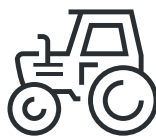
Agricultural and Forestry Equipment